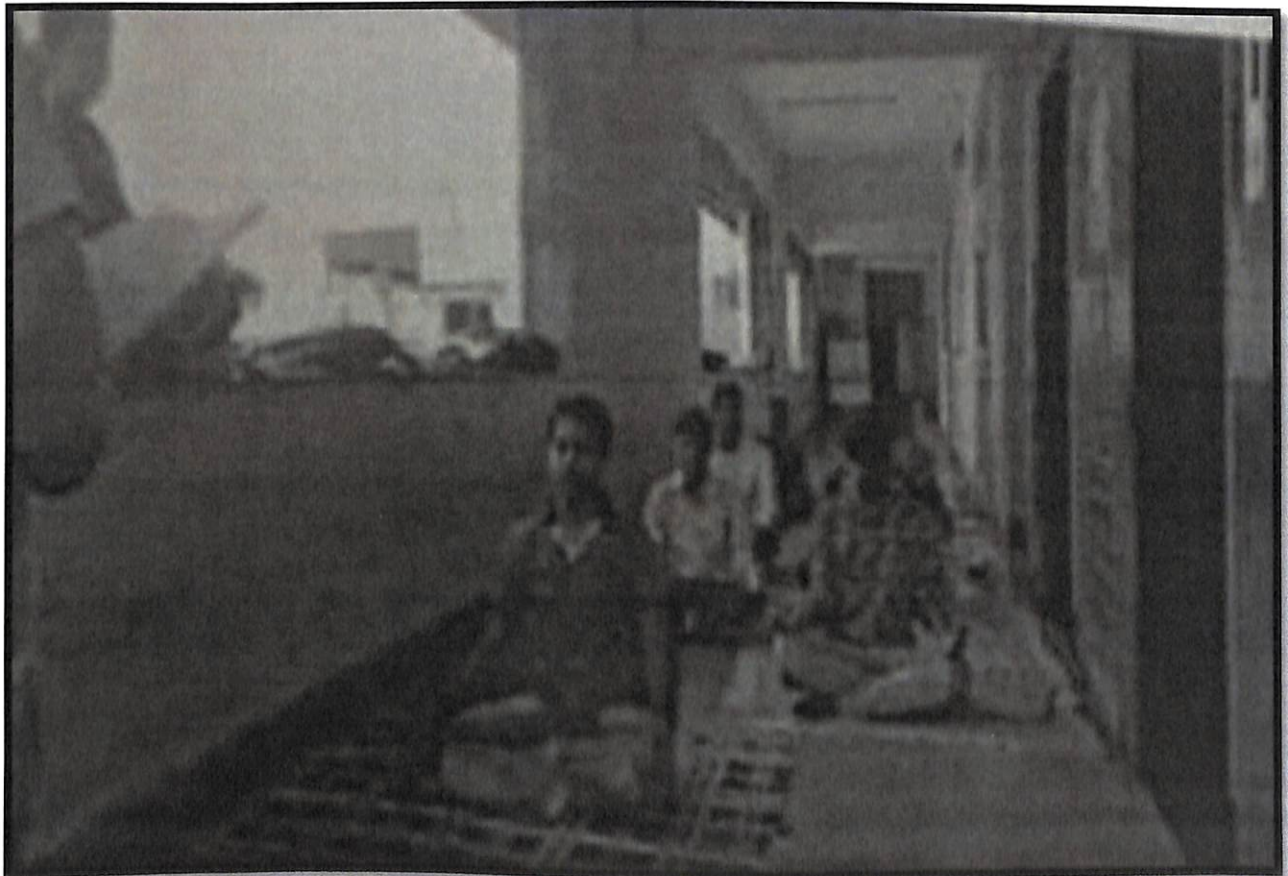
“Yoga Training For NSS Students on 13.06.16 to 20.06.16”