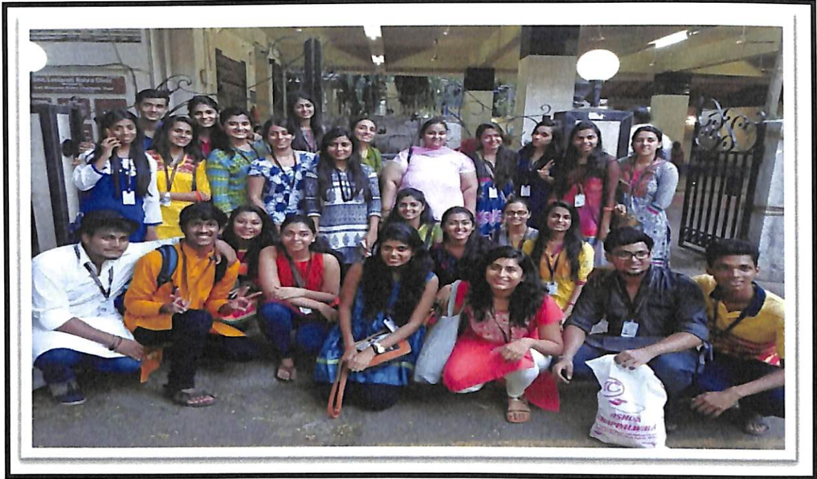
“World Elder Abuse Awareness Day on 15.06.2016”