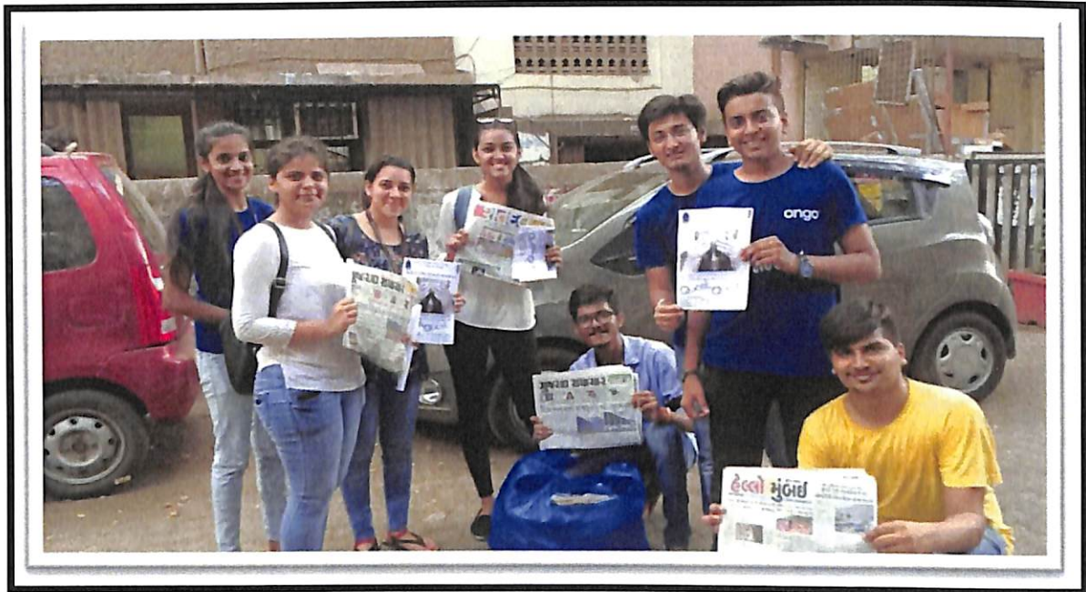
“News Paper Drive on 15.06.2016”