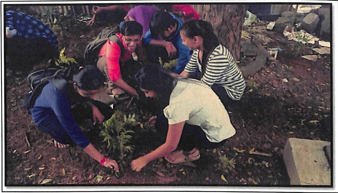
“Tree Plantation Drive on 8/8/2016 and 9/8/2016”