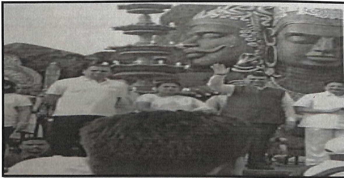
"Run for Unity Rally on 31.10.2016"

Activity -20 : Run for Unity Rally took place from Air India building and the Ending point was Marine Lines. CM Devandra Fadnavis graced the occasion.