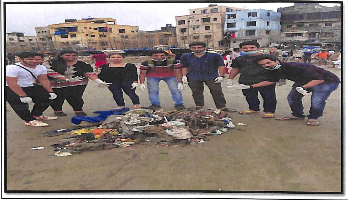
“Versova Beach-Clean Up Drive on 02.10.2016”