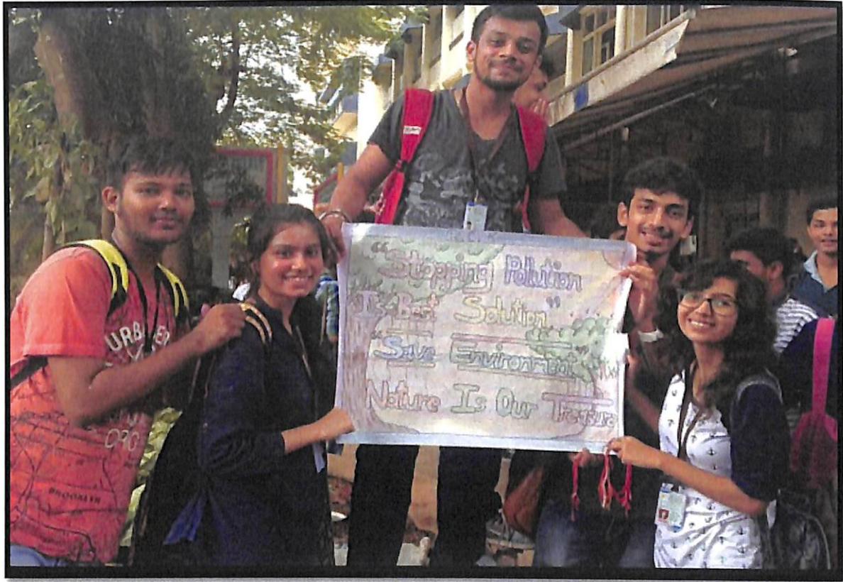
"Environment Awareness Campaign on 04.08.2016"