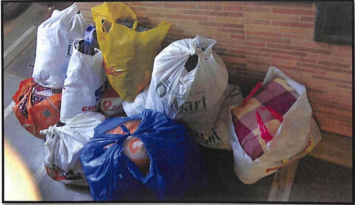
“Clothes Donation Drive on 30.06.2016”