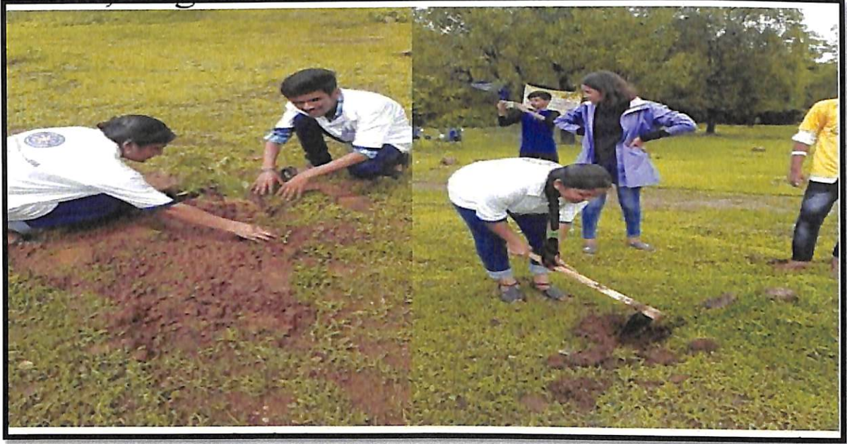
“Tree Plantation Drive on 21.07.16”

was inaugurated by the present and former Sarpanch.