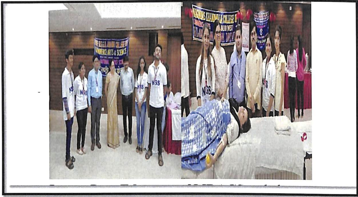
"Blood Donation Drive on 01.09.2016"