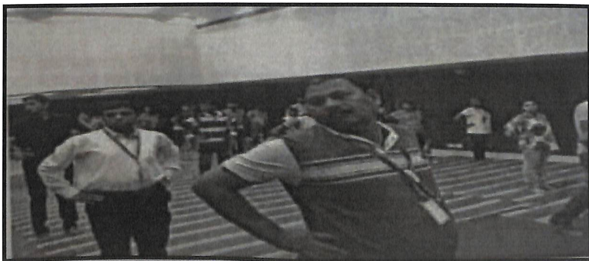
"International Yoga Day on 21.06.2016"