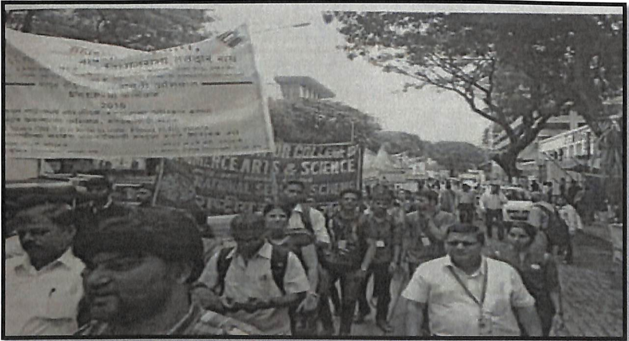
“Electoral Process Awareness Rally on 07.10.2016”