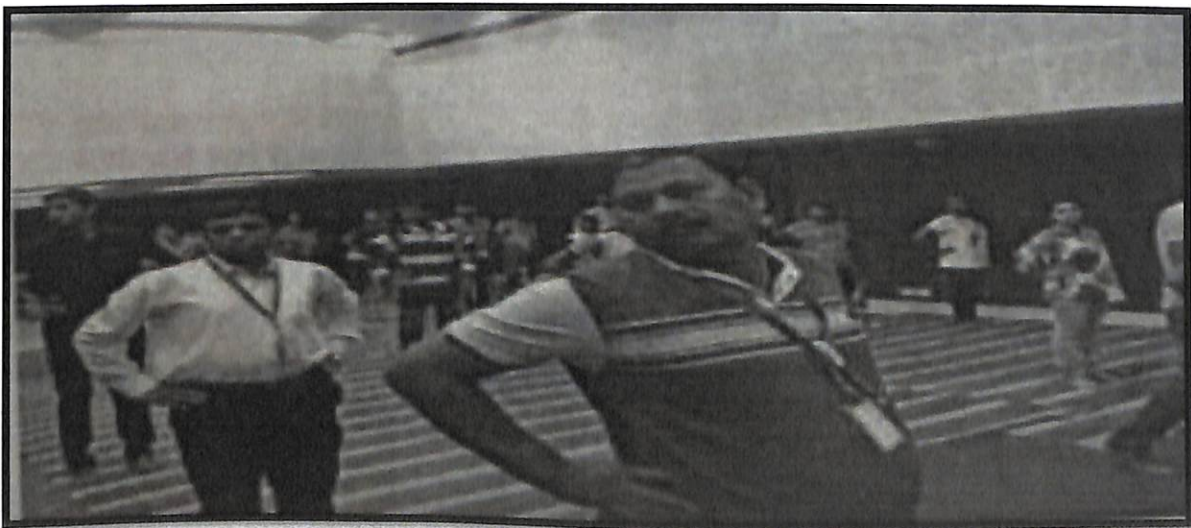
"International Yoga Day on 21.06.2016"