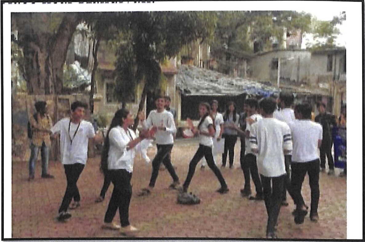
“Street Play at Film City on 15.08.16”