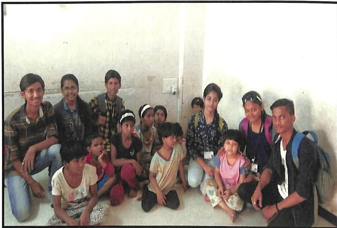
“Visit to Orphanage on 10.07.2016”